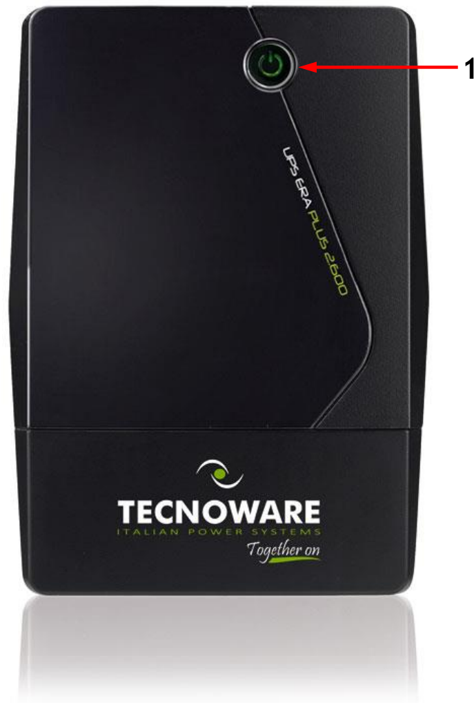
Figure 1 - Front panel